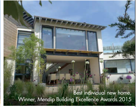
Best individual new home, Winner, Mendip Building Excellence Awards 2015