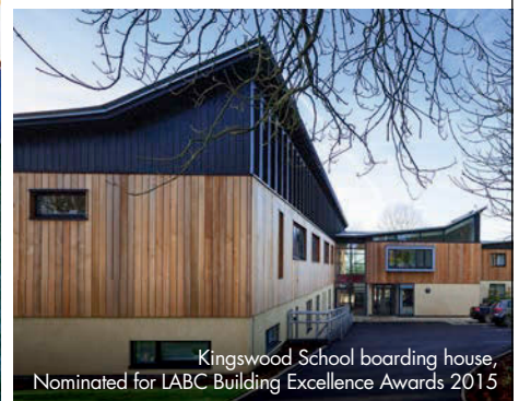
Kingswood School boarding house, Nominated for LABC Building Excellence Awards 2015